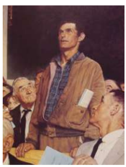
Freedom of Speech By Norman Rockwell (1943)

--United States Conference of Catholic Bishops