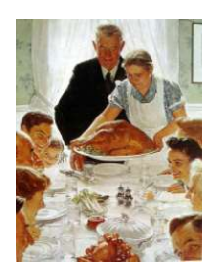
Freedom from Want By Norman Rockwell (1943)